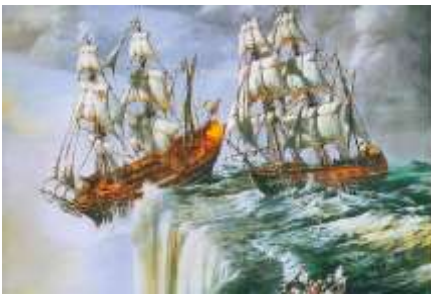
Is the world 'flat'...

Department of Sociology and Social Work University of Wisconsin-Stevens Point